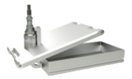
Ultrasonic sieve insert US07