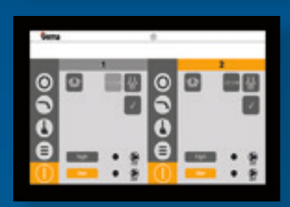
OptiControl powder management control