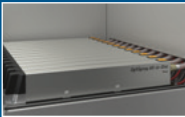
OptiSpray All-in-One spray unit integrated in OptiCenter (type OC10)

The unit incorporates Gema's proven powder feeding and electrostatic technologies to ensure precise powder flow, the highest consistency providing best and constant application results.