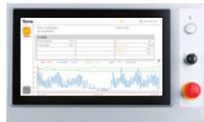
Measurement technology options for energy data acquisition for visualization on MagicControl 4.0