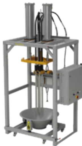
OptiFeed BigBag FPS16-E

An electropneumatic controller uses a sensor to monitor the powder flow and control the fresh powder supply.