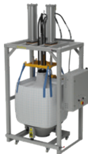
OptiFeed BigBag FPS16-E with BigBag