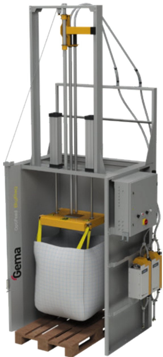
OptiFeed BigBag FPS16

The powder transport is monitored by the powder flow detection during the conveying procedure. If during a powder requirement by the level sensor no or too little powder flows through the conveying line within a defined time, this will be recognized by the installed sensor within the OptiFeed 4.0. This powder shortage actuates an automated up/down movement of the BigBag.