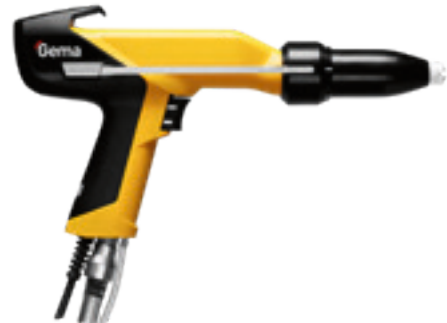
OptiSelect® Pro with SuperCorona